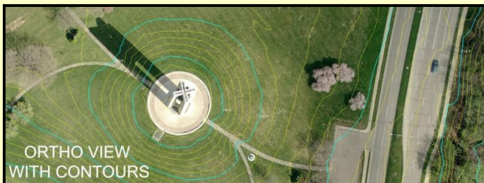
ORTHO VIEW WITH CONTOURS